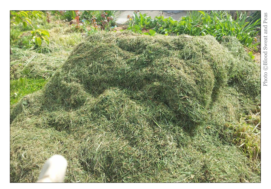
Keep big grass clipping piles off streambanks and out of the stream. They can smother and kill the plants in the riparian zone that are stabilizing the banks and preventing erosion and flood damage!

Salt Lake City has a curbside compost pickup program, <a href="https://www.slcgreen.com/compost-can.">www.slcgreen.com/compost-can.</a>