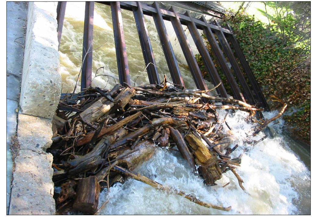
Trash racks are necessary to catch stream debris before it can cause serious damage during high flows, such as clogging culverts or snagging on bridge crossings. Help keep yard waste out of the stream in the first place!