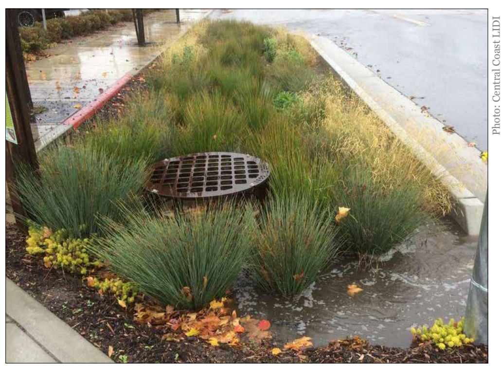
Storm drains flow directly into our rivers and streams. Here, a curb-cut directs stormwater into a bioretention facility <u>before</u> it goes down the storm drain. Plants and soils filter the pollutants picked up by runoff, such as road salts, vehicle oil/fluids, etc. In a traditional system runoff goes staight into the storm drain, sending pollutants straight to the stream.